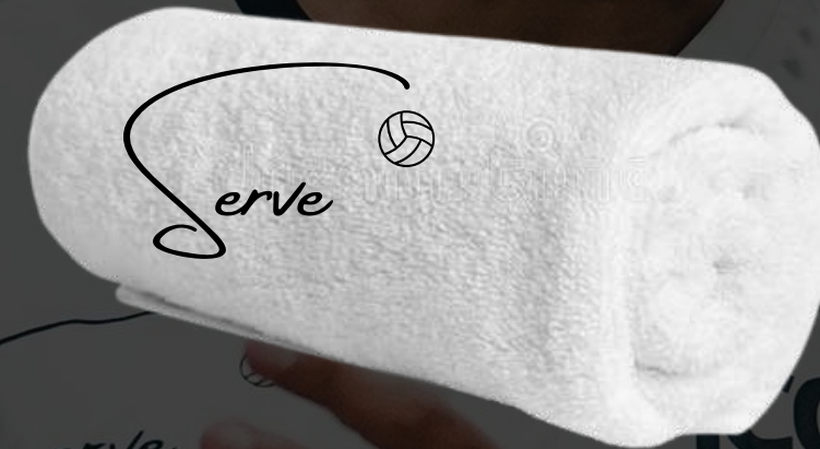
SERVE OFFICIAL TOWER